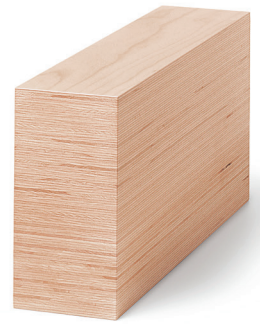
Beam BauBuche GL75

BauBuche GL75 is made from parallel-laminated 40 mm BauBuche S strips. Thanks to its exceptional strength, BauBuche GL75 is the ideal material for slender and elegant constructions and wide spans combined with high loads. The sides of the BauBuche GL75 elements show the attractive veneer pattern, with a plain hardwood finish at the top and the bottom. BauBuche beams are sanded at the factory and therefore ideal for exposed constructions.